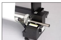
30kg take-up unit (optional) 20kg unit is also available.