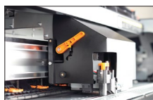
Three head height settings