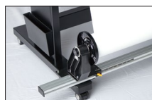
Media holder for feed (optional)