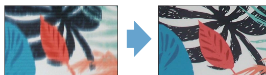
[Before feed correction]

By printing a print pattern and reading it with a sensor, paper feed correction is performed automatically.