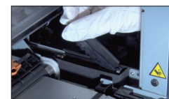
Replaceable cleaning wiper