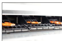
Partial pressure cancel mechanism

Equipped with a mechanism that enables media transport in optimal conditions. Combine with a take-up unit and media holder for smoother media handling capability.